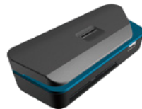
Combo Card Reader